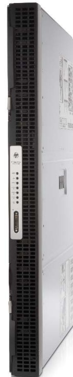
HPE Superdome 2 Server Blade (CB900s i6)