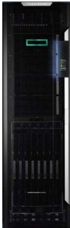
HPE Integrity Superdome 2