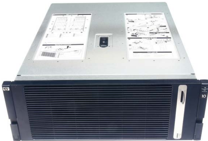
HPE Superdome 2 IOX