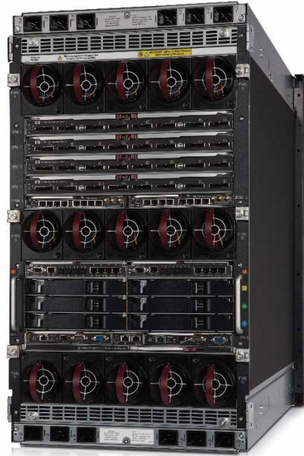
HPE Superdome 2 enclosure back