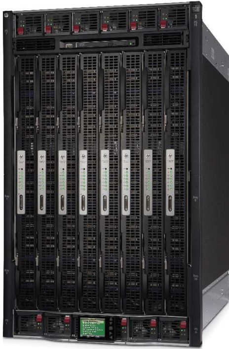
HPE Superdome 2 enclosure front